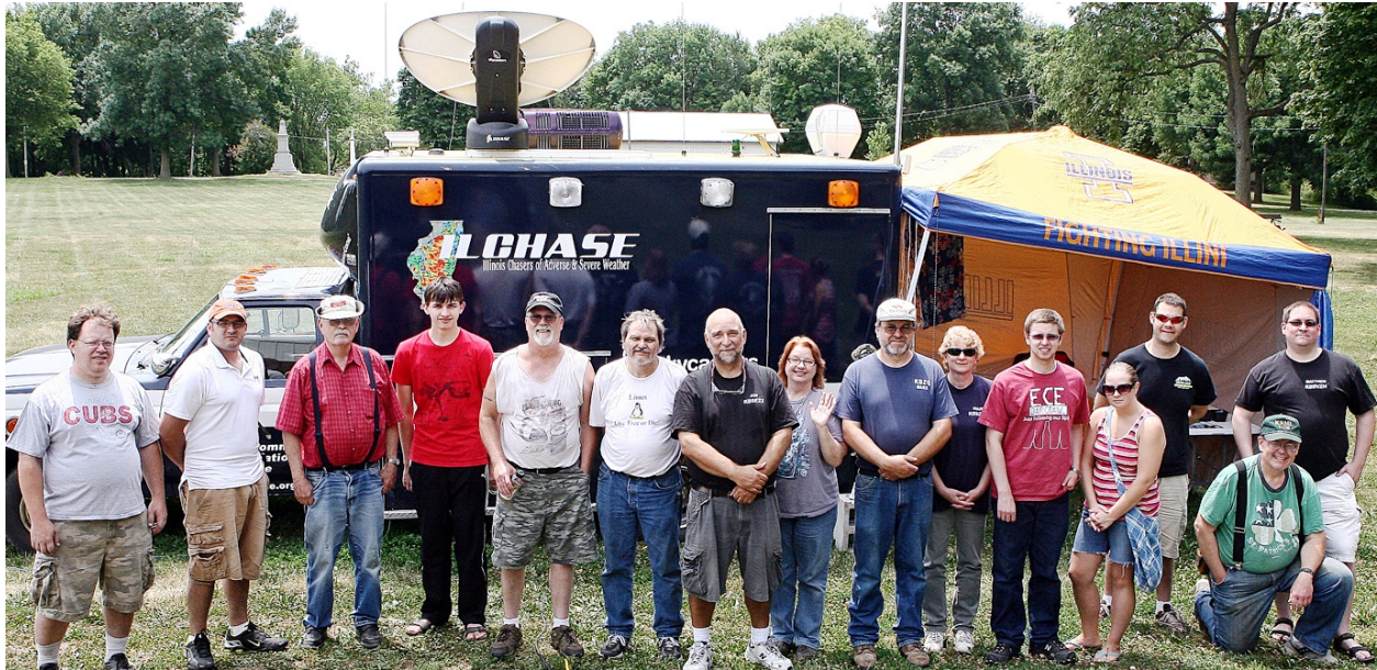
SRRC Field Day 2012 Shabbona Park