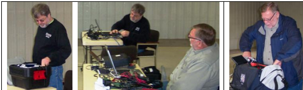
K9ZQ and KC9WWG show-off their Go-Kits.